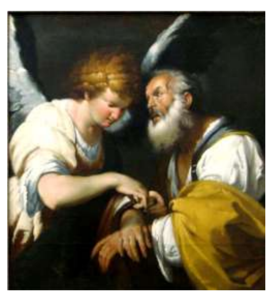
(Artist: Bernardo Strozzi Date: 1635)

But finally in the end I shall experience the thousand suns.