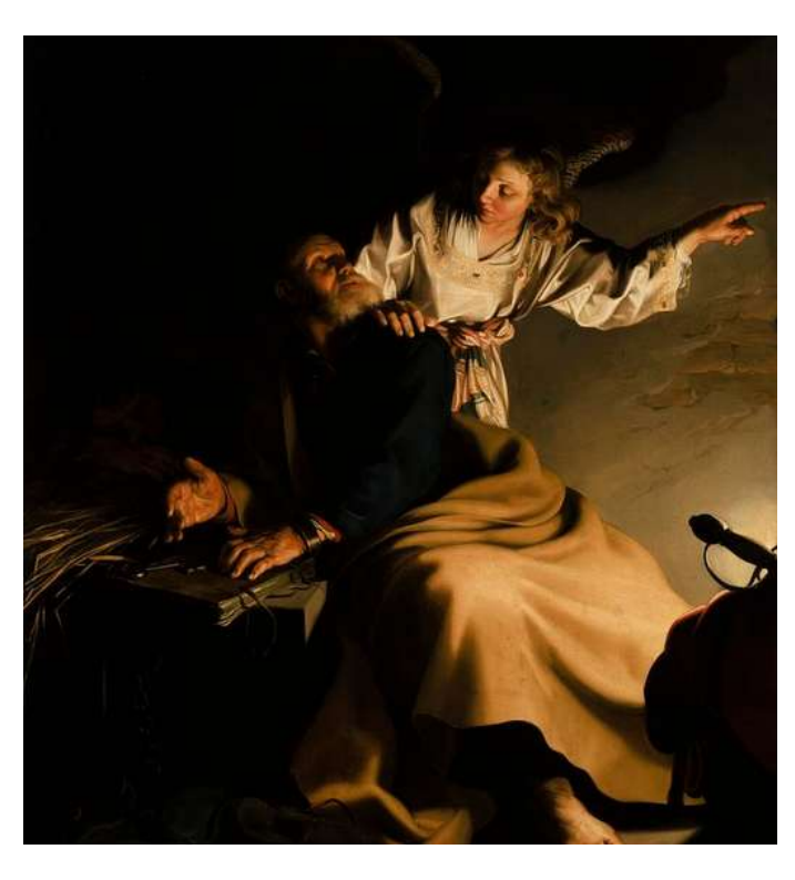
(Artist: Abraham Bloemaert Date: 1625)

But finally in the end I shall cross the endless mortal desert.