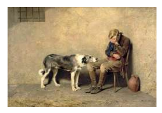
(Artist: Briton Riviere Date: 1869)

I have witnessed my soul in bondage. I have witnessed my soul in eternal