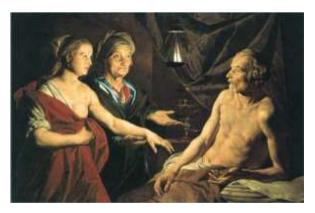
(Artist: Matthias Stom Date: 1639)

Even though I fail to act for the lord with subjective aloofness. Even though I fail to look for his