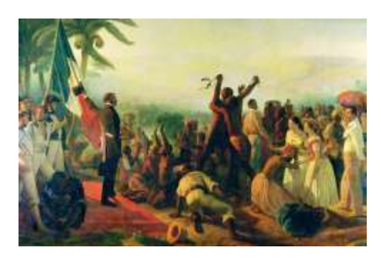
( Artist : Francois Auguste Biard Date : 1849)

I have witnessed the thousand channels of grace.